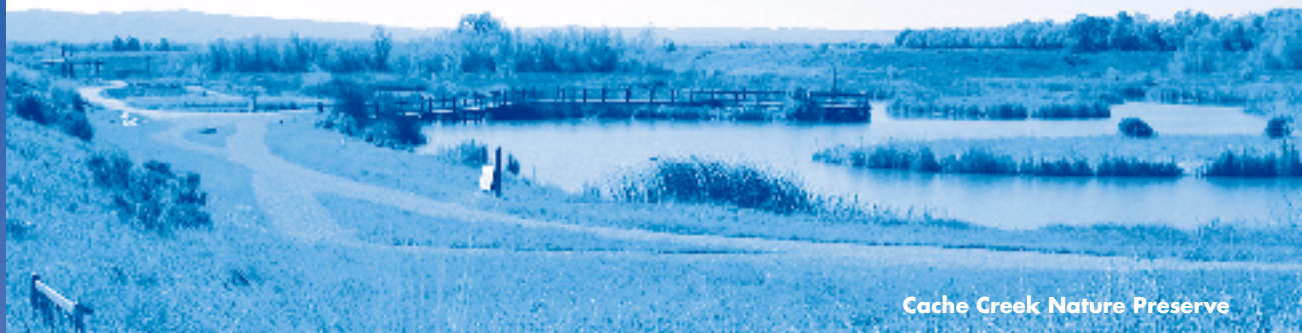
Cache Creek Nature Preserve

Davis, City of Dunnigan Water District Reclamation District 2035 University of California, Davis West Sacramento, City of Winters, City of Woodland, City of Yolo County Yolo County Flood Control & Water Conservation District