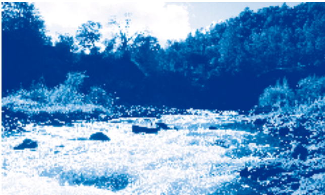
Cache Creek, Capay Valley

Help improve water resources in your area! Share your ideas or suggestions about potential water-related projects in Yolo County! Attend the first community workshop on November 30 at the Woodland Public Library.