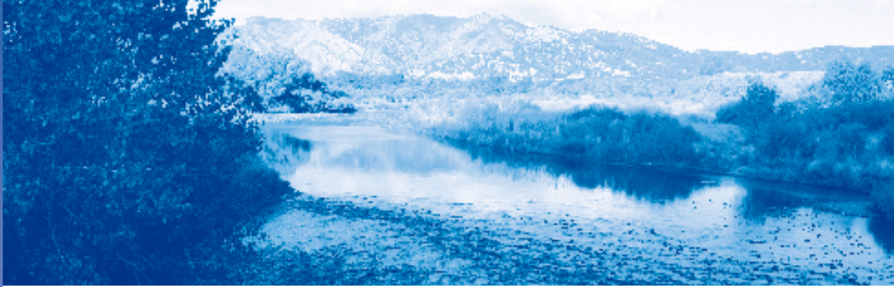
Cache Creek, Capay Valley

Davis, City of Dunnigan Water District Reclamation District 2035 University of California, Davis West Sacramento, City of Winters, City of Woodland, City of Yolo County Yolo County Flood Control & Water Conservation District