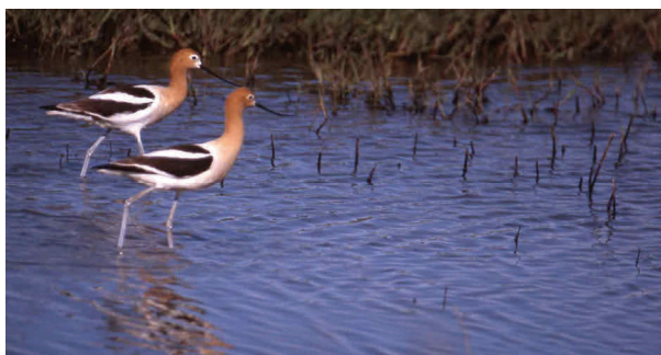
American Avocets, Yolo Bypass Wildlife Area (Dave Feliz)

Several studies were conducted under the direction of Yolo County with assistance from the Yolo Basin Foundation (YBF) to provide technical information into the development of a series of actions that would comprise the Yolo Bypass Conservation Measure in the draft Bay Delta Conservation Plan. These studies can be accessed on the County's website: www.yolocounty.org , Hot Topics, Delta eLibrary .