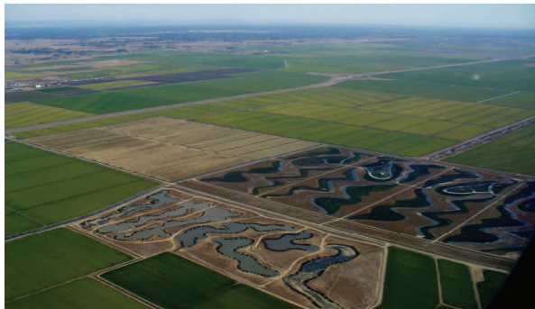
Irrigated land north of Sacramento Metropolitan Airport

The WRA Board received many presentations on key topics to stay informed and make decisions about regional issues in 2013.