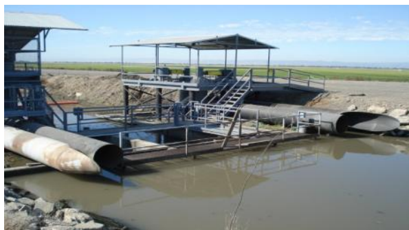
Reclamation District 108 Recycled Water Station with salvaged pumps & motors on the right bay

RD 108 completed a large project that improved the flexibility and management of recycled water by increasing the area served and reducing distribution system spills. The capacity of 4 recycle pumping plants was increased using salvaged pumps and motors. Recycled water comprises approximately 25% of RD 108’s total applied water. The project was funded by a CALFED grant administered by US Bureau of Reclamation with a 50-50 local funding match.