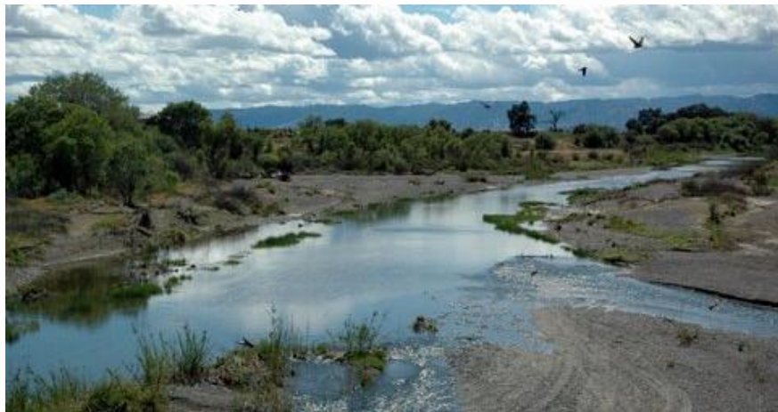
Creek Walk 2011, Cache Creek

The public is invited to attend and participate at WRA meetings. Meeting minutes and future meeting announcements are available on our website at http://www.yolowra.org .