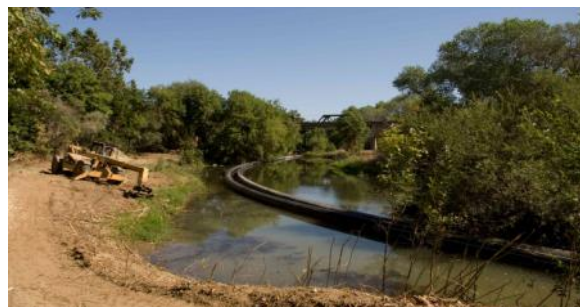
Putah Creek Channel Realignment Diversion pipes follow future meander of channel

Restoration work on the Putah Creek Nature Park is underway. The project will narrow the creek’s flow channel and lower its floodplain. This restoration improves fish and wildlife habitat while giving the community better access to