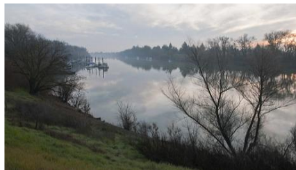
Sacramento-San Joaquin Delta

Water Resources Association of Yolo County