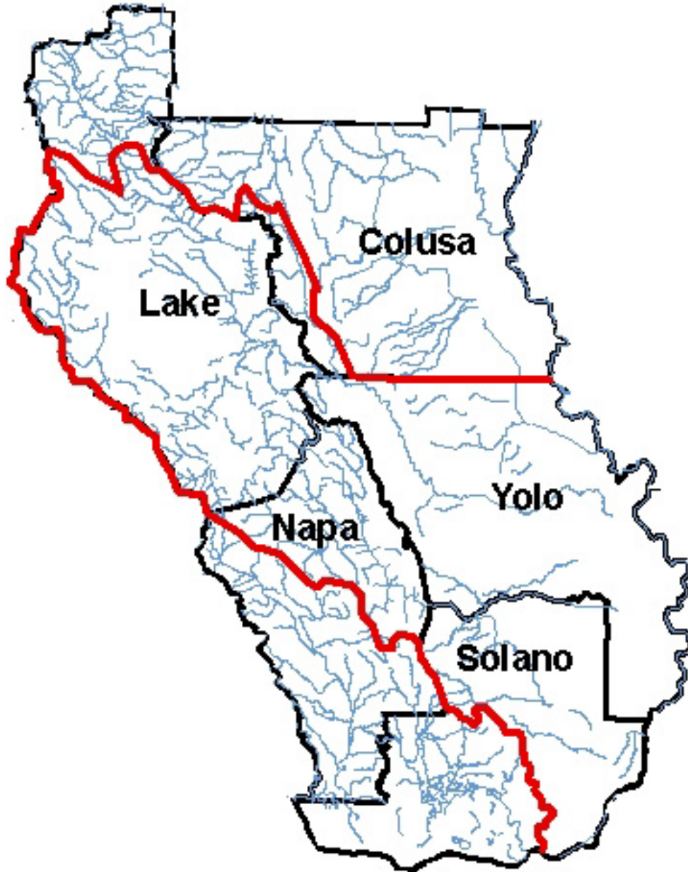
Map of the Westside Sub-Region of the Sacramento River Funding Area