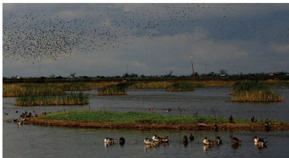
Yolo Bypass in Winter