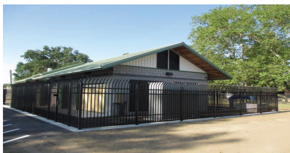
City of Woodland, Aquifer Storage & Recovery Project, Well #28

The Westside continues implementation successes with 3 grant awards for its partnership. The IRWM Emergency Drought Grant Solicitation (2014) for Yolo and Solano, IRWM implementation funding for Lake and Napa (2015) and an EPA Brownfield grant for mercury contamination assessment (2015).